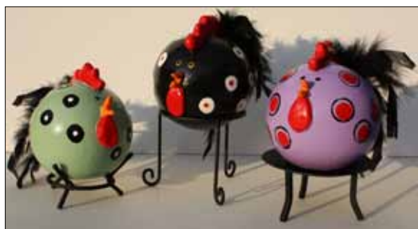
"Gourd Madness Showcase"

"Selections from the Irvine Museum," October 6 to Feb 13: The Irvine Museum, 18881 Von Karman Ave, Irvine, CA.