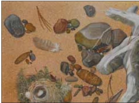
Watercolor by Kyila Sninsky

“Absolute Abstract” For the month of January the fourteen artists of Viewpoints gallery present an all abstract show. Join the Viewpoints’ artists at the gallery for an