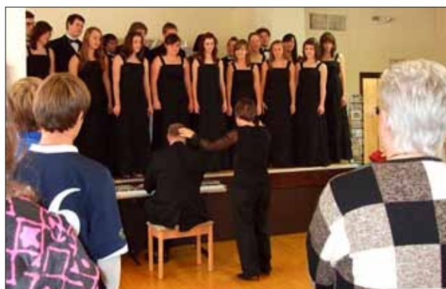
Left: Visitors are looking at mini watercolor paintings. Above: Choir of Berean Christian High School performed at the party