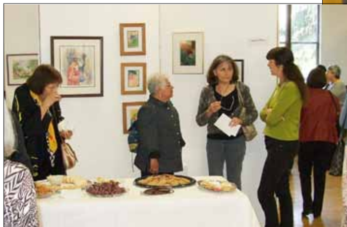
Below: Art, food and friends.