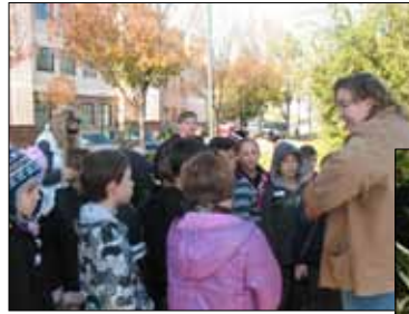
Las Juntas Elementary School