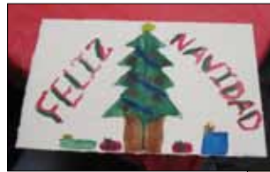
Monument Community Project