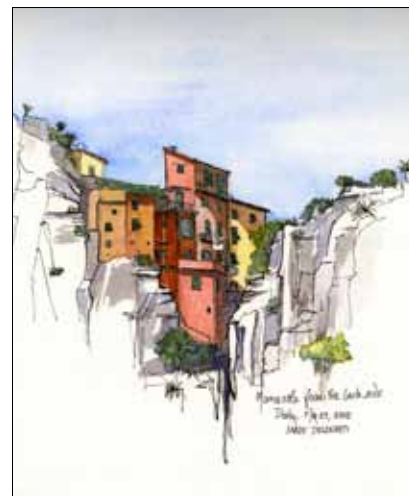
"Manarola Backside" by Sandy Delehanty

Italy September 7 - 14, 2011. I have traveled to this charming part of the Italian Riviera twice before to paint the five tiny fishing villages that are now preserved as the Cinque Terre National Park. I am thrilled to have the opportunity to take my students with me this time and show you all my favorite painting sites in Riomaggiore, Manarola, Vernazza, Corniglia and Monterosso. All-inclusive (lodging, all meals, wine tastings, instruction, local transport) $2,899.00 double occupancy and $2,999.00 single occupancy. A deposit of $250.00 will insure your space in this small group workshop. Details and enrollment form available at www.ToscanaAmericana.com , questions call Sandy at (916) 652-4624.