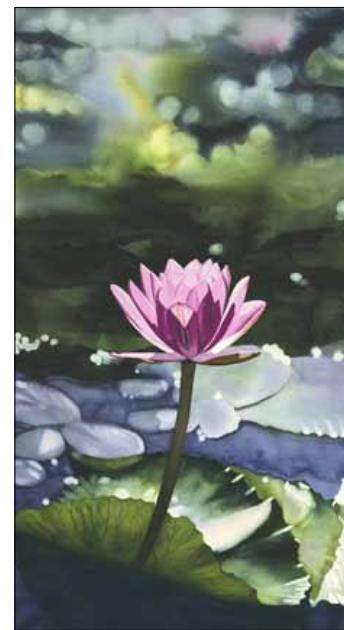
"Water Lilies" by Kathleen Alexander

Kathleen Alexander , WW, NWS, is holding three watercolor workshops as well as weekly classes this fall. Weekly classes are from September 30-November 25, from 10 am - 12:30 pm and an evening session from 6:30 - 9 pm. Workshop #1: Painting Flowers , October 23, 24, 25, Workshop #2: Painting Flowers & Glass , November 13, 14, 15, Workshop #3: Painting Waterlilies & Lilyponds , December 4, 5, 6. The classes will be held in Pacifica. For more information, visit www.KathleenAlexanderWatercolors.com or call Kathleen at (650)355-6362.