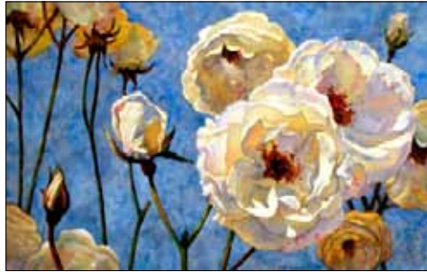
“Blue, White and Gold Roses” by Claire Verbiest

“Vibrant Watercolors” Workshop, Claire Verbiest, KA, NWS, CWA. March 26-28, 2010 - 9:30 to 3:30 pm. Walnut Creek, CA. With the help of demos, lectures and lots of hands-on lessons, we will explore together the unique properties of the fluid and transparent medium of watercolor. Topics such as how to render light, work with color, contrast and value, shape, texture and composition will be addressed. We will use a variety of subject matter to produce paintings full of energy and strength. The course is designed for all levels of expertise. There will be lots of time to paint as well as individual help and critiques. The price is $295.00 for three days. Class size is limited, so register early. Call (925) 639-7161 for more information or email pam.howett@sbcglobal.net.