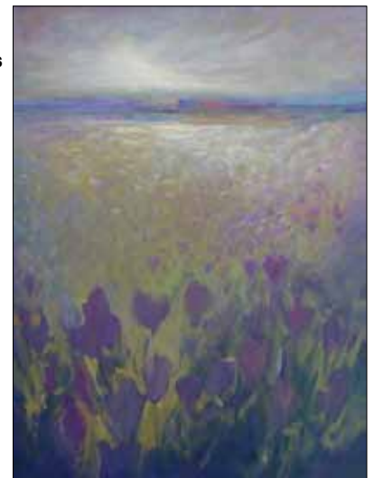
"New Day" by Kay Athos