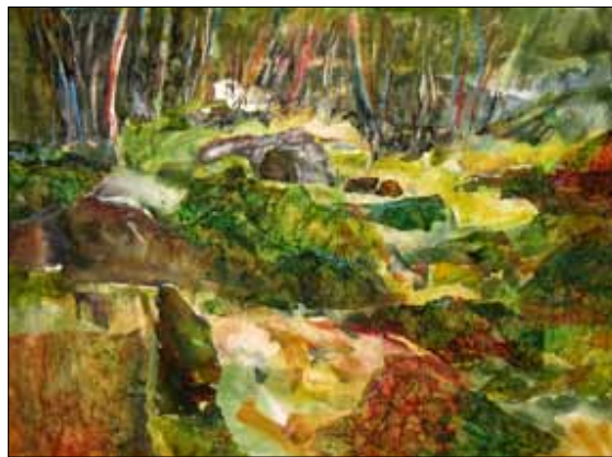
"Verdant Passage" by Juanita Hagberg

Gallery Concord is at 1765 Galindo St, Concord CA 94520 (at the corner of Galindo & Clayton). Free parking is available off Clayton Road behind the gallery. Gallery phone is (925) 691-6140. www.concordgallery.org