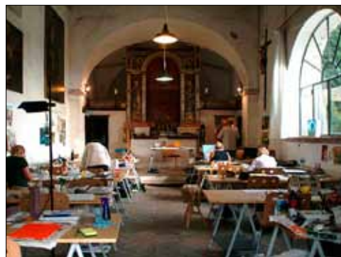
La Romita School of Art

Journey to La Romita School of Art, established 40 years ago in a beautifully restored 16th century monastery located in the Umbrian hills between Rome and Florence. Umbrian chefs prepare our meals and pack lunches for daily excursions. Accommodations feature rustic, restored bedrooms with modern bathrooms at each end of the hall. Daily watercolor instruction given. Transportation is provided to all sites, Assisi & Perugia, including airport