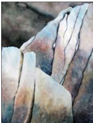
Fractured Granite by Iretta Hunter