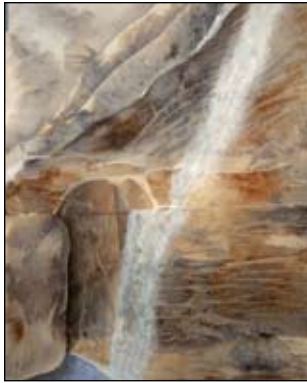
Vernal Falls