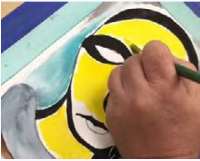
Veterans busy creating at the Martinez VA Outreach Program