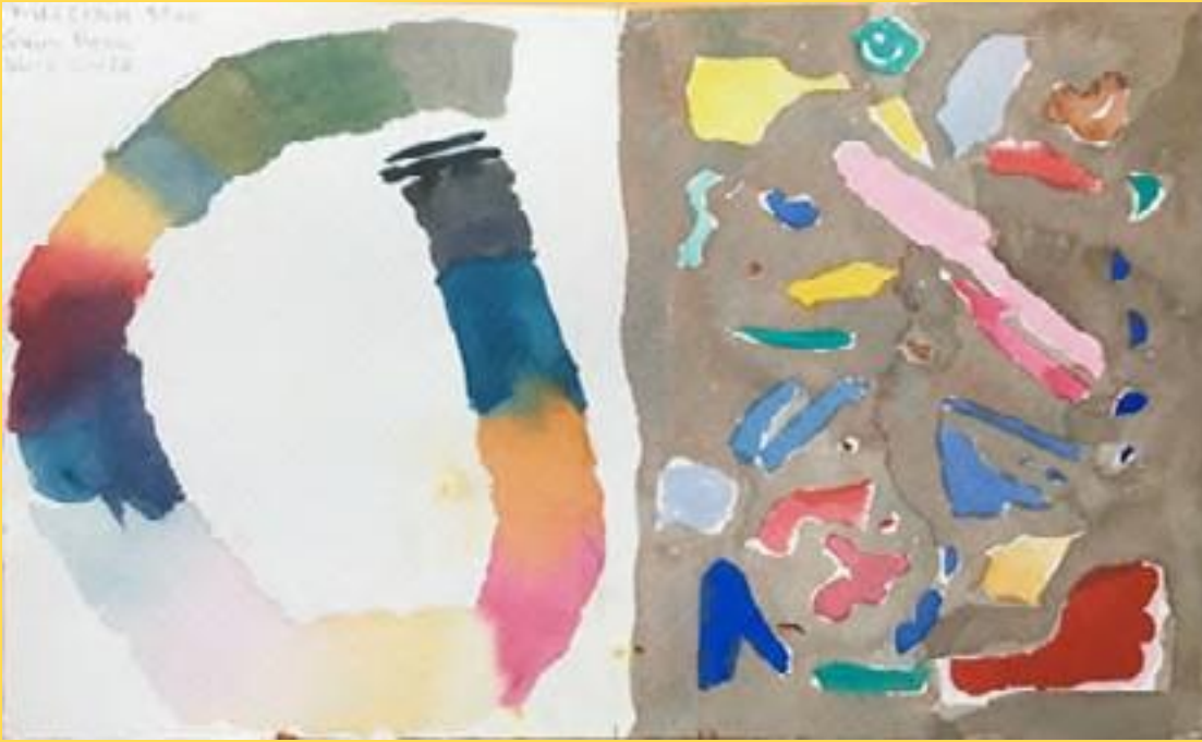
Oakland Veterans go Abstract in March

Oakland Veterans Outreach needs your help!