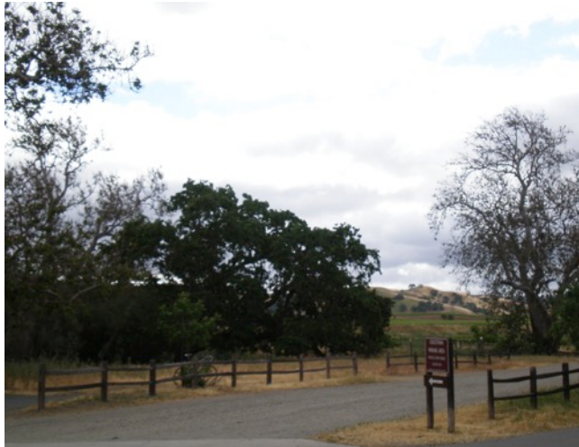
Arroyo entrance (more wooded)

1051 Wetmore Rd. Livermore, CA, 94550 Friday, June 12, 2015