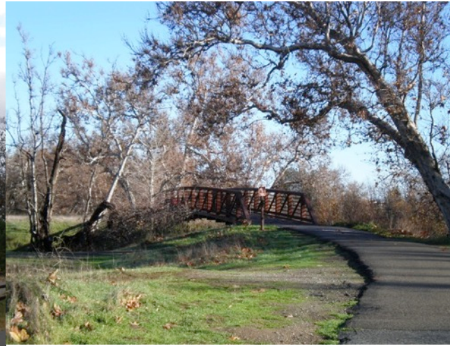
Wetmore entrance (more open)

Join CWA at one of the tri-valley's nicest parks. Surrounded by vineyards and olive groves, Sycamore Grove boasts 775 acres of parkland. Two entrances to the park each have many scenic items to paint, such as bridges, arroyos, trees, and wildlife. A 2.5-mile paved walking/bike path connects the two entrances, and there are many off-path trails for more adventurous painters. If you want to explore the park's interior, a trail bike makes that a little easier. Note: parking is $5 per car per day; one ticket is good at both entrances. Also, at both entrances are bathrooms.