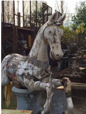
Artefact Design & Salvage