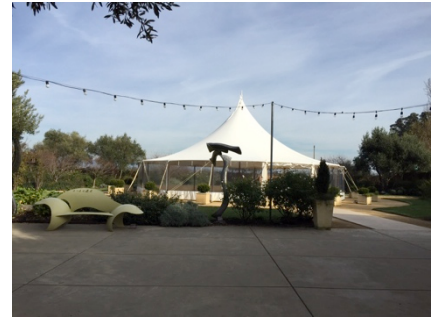
Giant tent on the grounds

Join CWA at Cornerstone Sonoma for a quirky plein air experience. You will find statues, a giant tent, a massive blue Adirondack chair, hills, people, water features, and planter displays. Cornerstone has a restaurant, numerous shops, seating areas, and restrooms. For more information about Cornerstone Sonoma, see http://www.cornerstonesonoma.com/ .