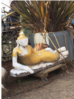
Artefact Design & Salvage