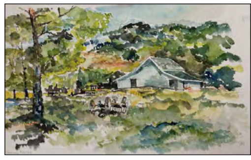
Watercolor by Chuck Dorsett